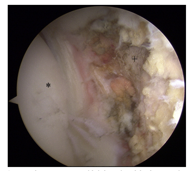
Fig 2. Arthroscopic view of left hip after debridement of LT stump from fossa. The patient is in the supine position, with visualization of the central compartment of the hip through the anterolateral portal. (Asterisk, femoral head; plus sign, fossa.)

A guidewire (Arthrex) is placed through the femoral tunnel and into the posteroinferior portion of the fossa; its position is verified by direct visualization. Once the correct position has been achieved, the guide is drilled to the medial cortex, without penetrating it, with