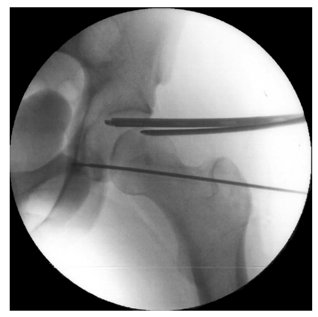
Fig 3. Fluoroscopic intraoperative image, anteroposterior of hip, with hip in internal rotation. After reaming of the femoral tunnel over a guidewire, the guidewire is passed through the femoral tunnel into the desired location of the acetabular tunnel. The hip is placed in internal rotation to accommodate correct placement of the guidewire. The guidewire is drilled into the acetabular footprint, with care taken not to penetrate the medial cortex of the acetabulum.

fluoroscopic assistance (Fig 3). Over the guidewire, a cannulated reamer (Arthrex) is used to create the acetabular tunnel. The reamer used is determined by the graft size, which is measured during graft preparation. Fluoroscopic assistance is used to ensure that the guidewire is not penetrating into the pelvis, and the drilling is performed cautiously to avoid plunging through the medial cortex of the acetabular fossa.